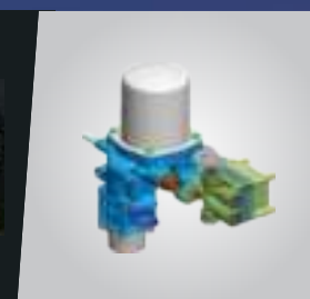
ADVANCED APDA (AIR PROCESSING & DISTRIBUTION ASSEMBLY)