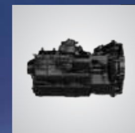
6-SPEED GEARBOX WITH OVERDRIVE