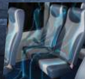
3 POINT ELR SEAT BELT FOR DRIVER and 2 POINT LAP SEAT BELT FOR PASSENGERS