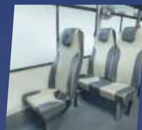
COMFORTABLE LEG ROOM