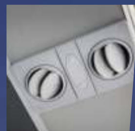
POWERFUL AIR CONDITIONING