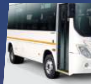
FULL SIZE PASSENGER DOOR