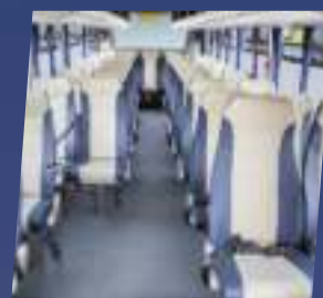
MOST SPACIOUS IN THE CATEGORY