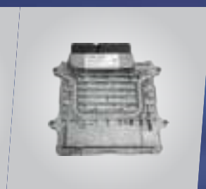
VOLVO GROUP'S EMS